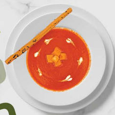
04 Tomato Soup 🌱 Rich creamy tomato soup 220