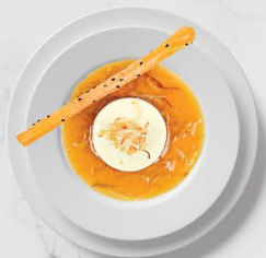
03 French Onion Soup 🌱 Traditional French onion soup served with cheese flutes 220