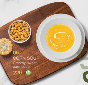
05 CORN SOUP Creamy sweet corn soup 220 🌱