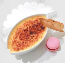
05 Creme Brulee 180