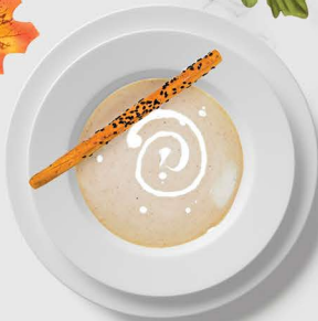
02 Mushroom Soup 🌱 220