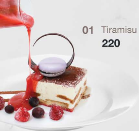
01 Tiramisu 220