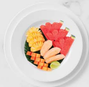
08 Mixed Fresh Fruit 120