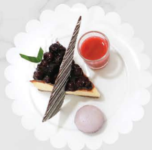
03 Blueberry Cheese Cake 180