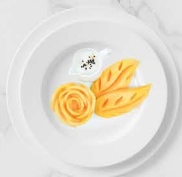
07 Mango Sticky Rice 180