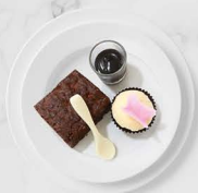
06 Brownie Cake with vanilla ice cream 180