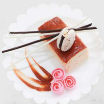
04 Thai Tea Cake 180