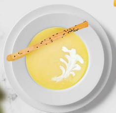
01 Pumpkin Soup 🌱 Coriander foam, olive smeared ciabatta, chili oil 220